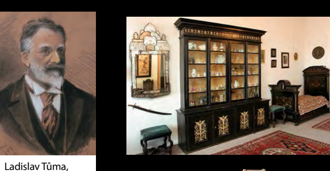
the portrait of Julius Zeyer (1841 – 1901)