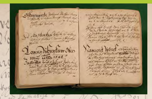
Long-term exhibiton at the ground floor of the former synagogue